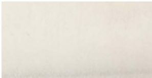
Satin Nickel PVD