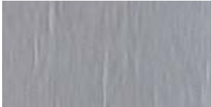
Brushed Chrome PVD